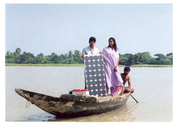
Fig 1.3 Solar Technology for Island Dwellers in Bangladesh

These challenges can be met by increasing energy efficiency through innovations in technology and processes, as well as by increased use of renewable energy, resulting in lower emission increases and eventually, in emission reductions.