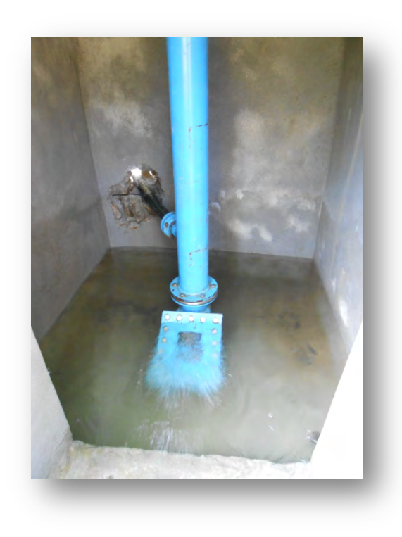
Fig 5.4.1 Hydram