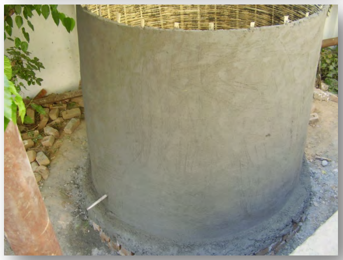
Fig 5.2.6.1 and Fig. 5.2.6.2 Bamboo-cement based rain water storage tank under construction

The cost of building one 3.000-litre tank comes to Rs. 14,000. Since the base is made of bamboo and not steel, as well as no bricks are used, it is also environmentally friendly.