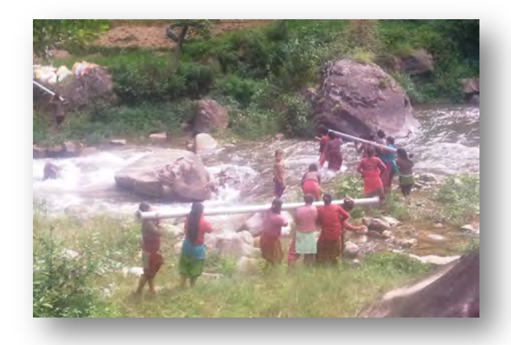
Fig 5.4.2 Women's contribution towards the implementation of the hydram project

The collective impact of this development has been felt the most in the status of women in the Nepalese community at Sanigaun-5, Balthali. Not only has the project improved women's communication skills, it also has given them greater confidence, leadership, and decision-making capacities.