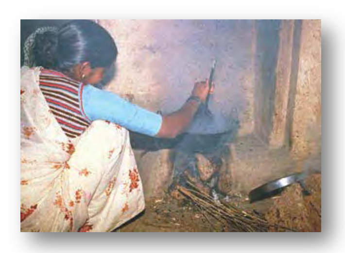
Fig 4.5. Cooking on 3-stone

Women cooking in the smoky kitchen said: