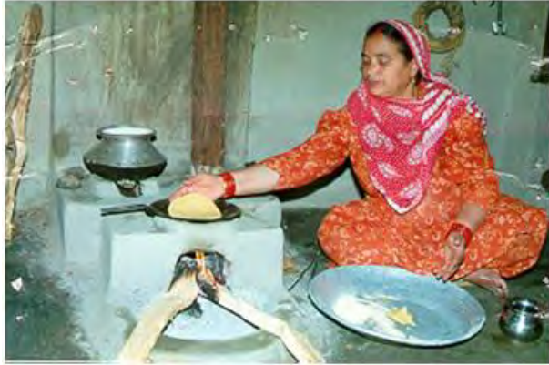
Fig 2.1 Smokeless Stoves and Organic Gardening are part of the Eco-Village Development Concept

The rationale for choosing villages as the focal point of this model is that they are home not only to some of the poorest people in the South Asian region, but also to the majority of the population. Furthermore, some of these people are also the most vulnerable to climate-mediated risks due to a combination of geographical location with endemic economic, informational and social deprivation. Usually left at the fringes of national and sub-regional governmental policy making, villages are ill equipped to cope with the rapidly evolving but little understood impacts of climate change on their land and livelihoods. Village communities also are ideal for illustrating the concept of contextually