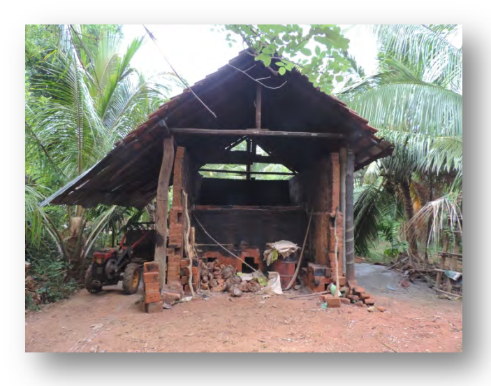
Fig 5.3.2 Dharmarantne's improved and permanent brick kiln

firewood openings. Importantly, both firewood and rice husk can be used as firing fuels. This kiln also has additional firing channels. With the upgraded procedures, the stacking of bricks inside the kiln is done systematically with interlayer gaps to be filled with paddy husk to improve the heat circulation and to get the maximum heat benefit. The improvements in the brick kilns has reduced the consumption of firewood substantially, creating additional economic benefits for brickmakers such as Dharmaratne while also reducing tree-felling for firewood. This, in turn, has eliminated