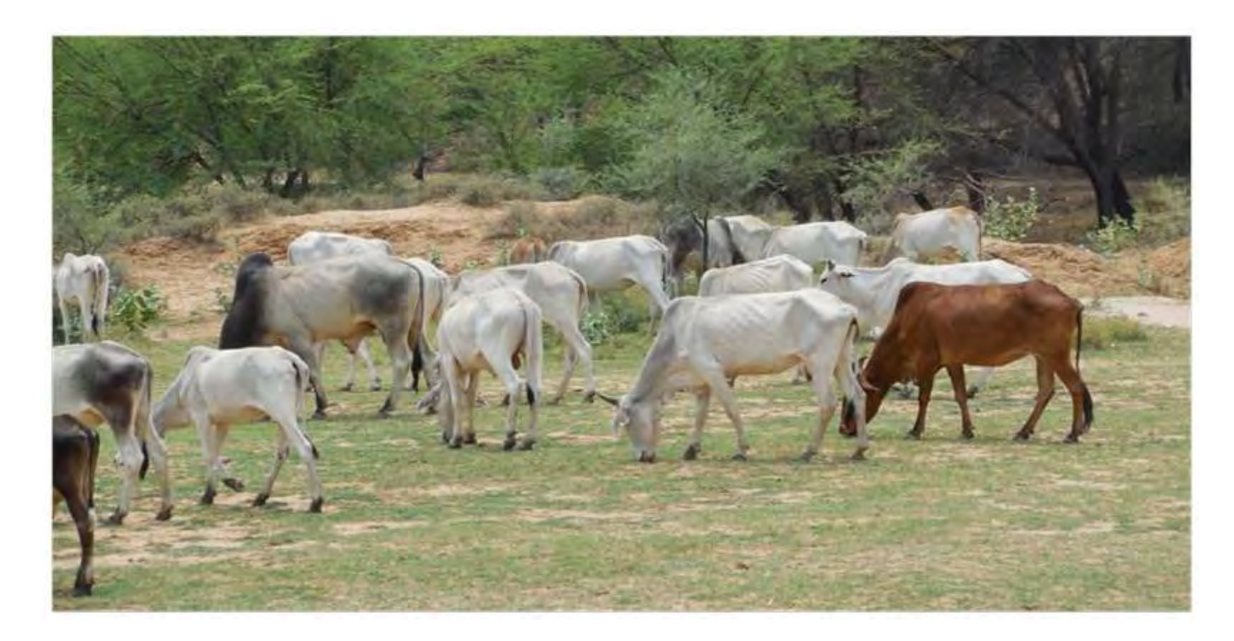
Fig 1.2 Potential for Biogas Energy

On the basis of Purchasing Power Parity (PPP), South Asia energy intensity is lower than the world average, including the United States and China. Energy intensity is based on commercial fuels. These low numbers also reflect a high proportion of non-commercial energy, e.g., traditional biomass, etc.