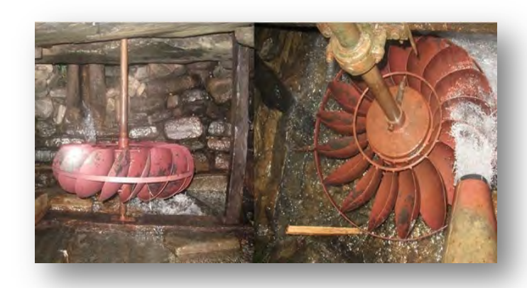
Fig 5.4.4 Improved water mill

The Improved Water Mill technology complements the essence of the ecovillage development concept. Not only is it a source of clean energy, it also has enhance cobenefits that can livelihoods. It is ideal for the hilly terrain of Nepal, which has plenty of water resources and enough height for the system to work. Over the last few decades, many changes have been made to the technology, making it more efficient, time-saving, and versatile in use. Center for Rural Technology, Nepal (CRT/N) has implemented an enhanced