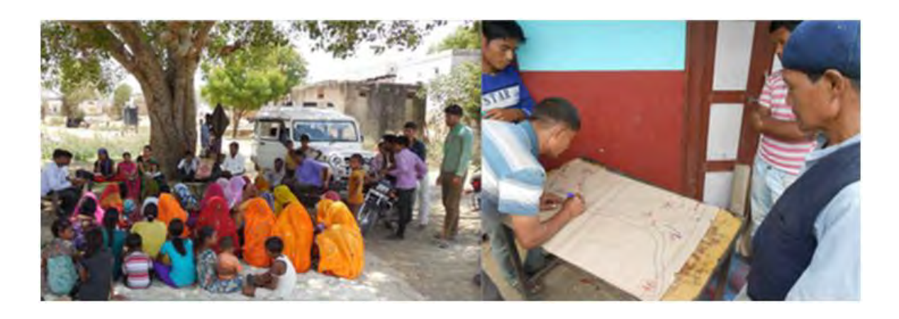
Fig 3.1 Villagers meeting and roadmap planning for policy makers