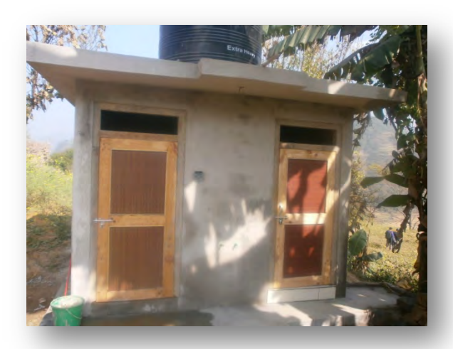
Fig 5.4.3 Toilet and water tank built after Hydram installation