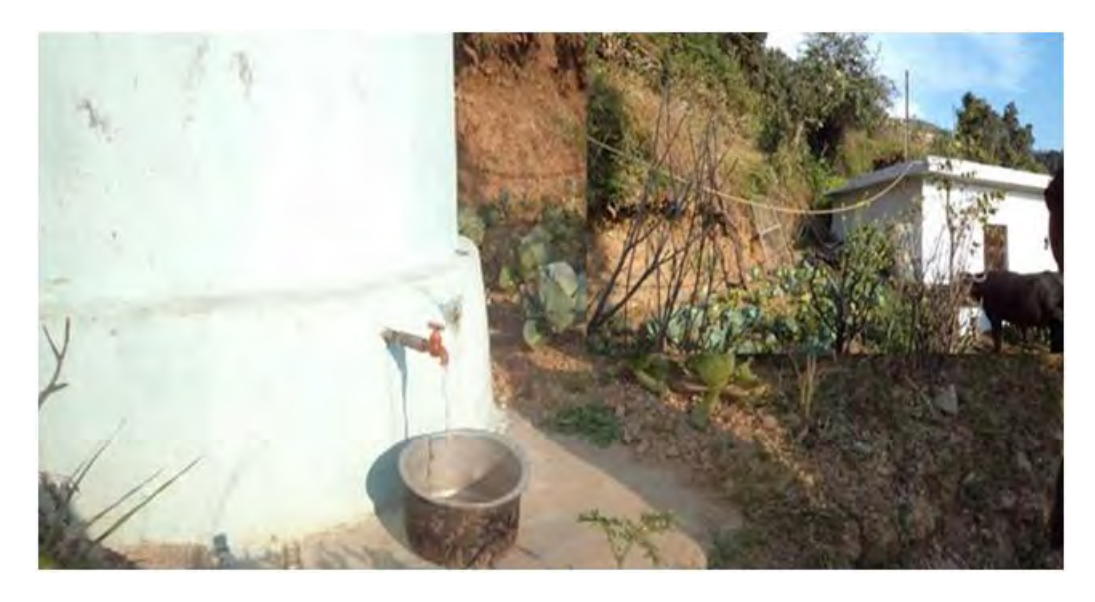
Rooftop rainwater harvesting: Rainwater from roof catchments can be channelled into storage tanks and this can be used for household activities as well as for kitchen gardening. If filters are used, this water can also be used for drinking.