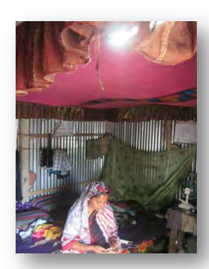
Fig 5.1.3 Rupali sewing in solar-powered light at night

The village Khowamuri is now well along the path of sustainable and environment friendly development.